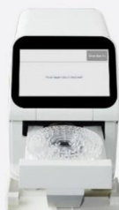
2. Insert disc