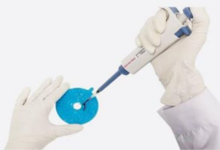
1. Add sample & diluent

From sample to complete results in 3 simple steps in approximately 13 minutes