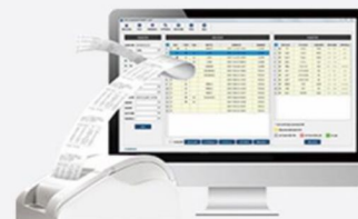
3. Read results