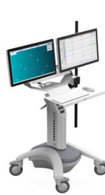
UROMIC Symphony with dual touchscreen monitors mounted side by side to visually maximise the entire processes.