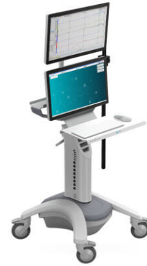
UROMIC Symphony with dual touchscreen monitors mounted top and bottom to visually maximise the entire processes.