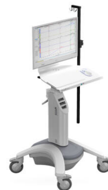
UROMIC Symphony configured in a compact, cost effective format is designed to meet your daily clinical needs.