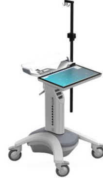
UROMIC Symphony with touchscreen monitor with a flexibility to view either the process or keyboard layout.