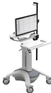
UROMIC Symphony with touchscreen monitor and wireless medical grade keyboard and mouse.