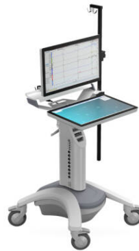
UROMIC Symphony with dual touchscreen viewing monitors with a flexibility to view either the processes or keyboard layout.